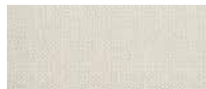
BEATRICE LIGHT GREY