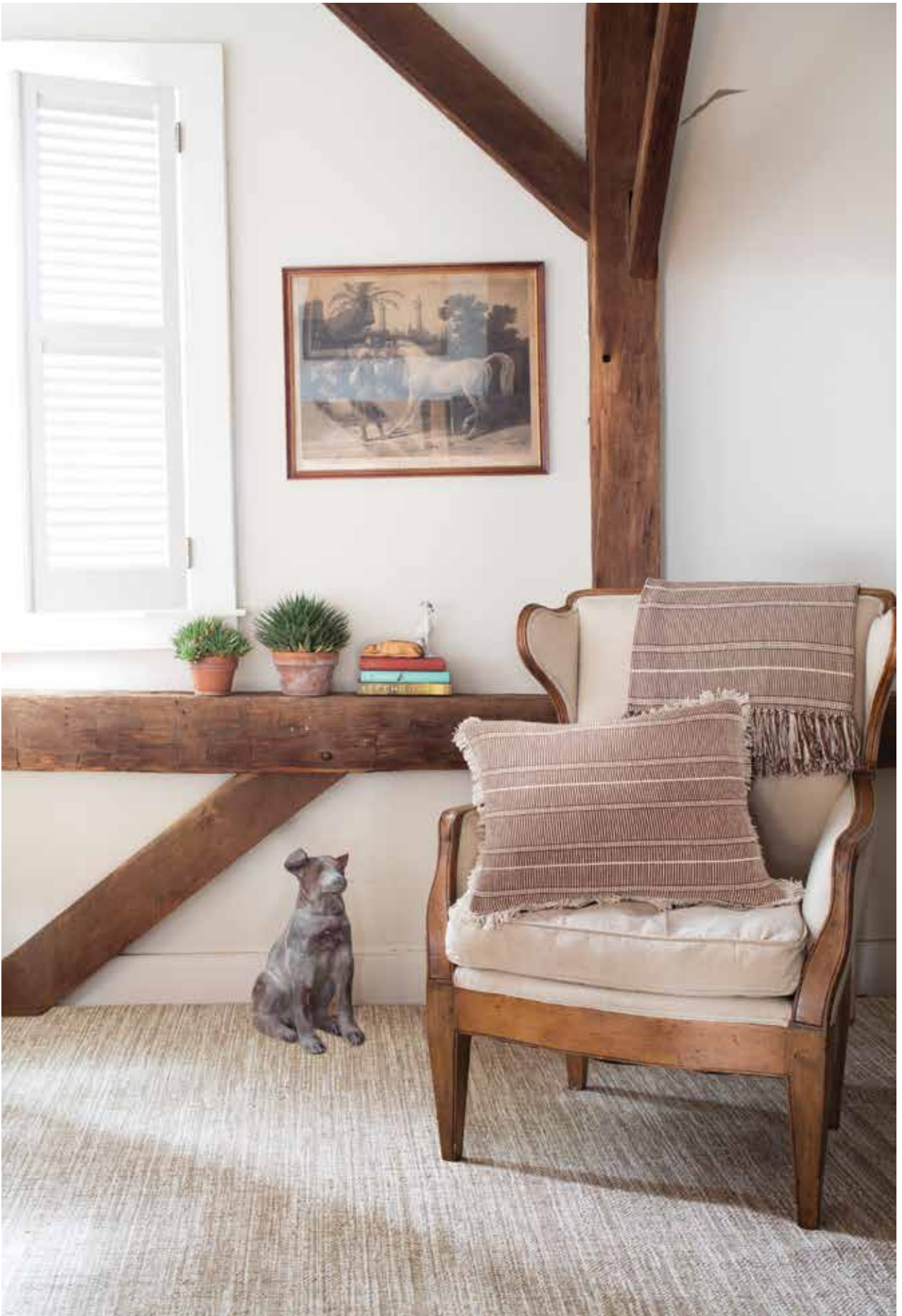
Bella Oak, wool woven rug