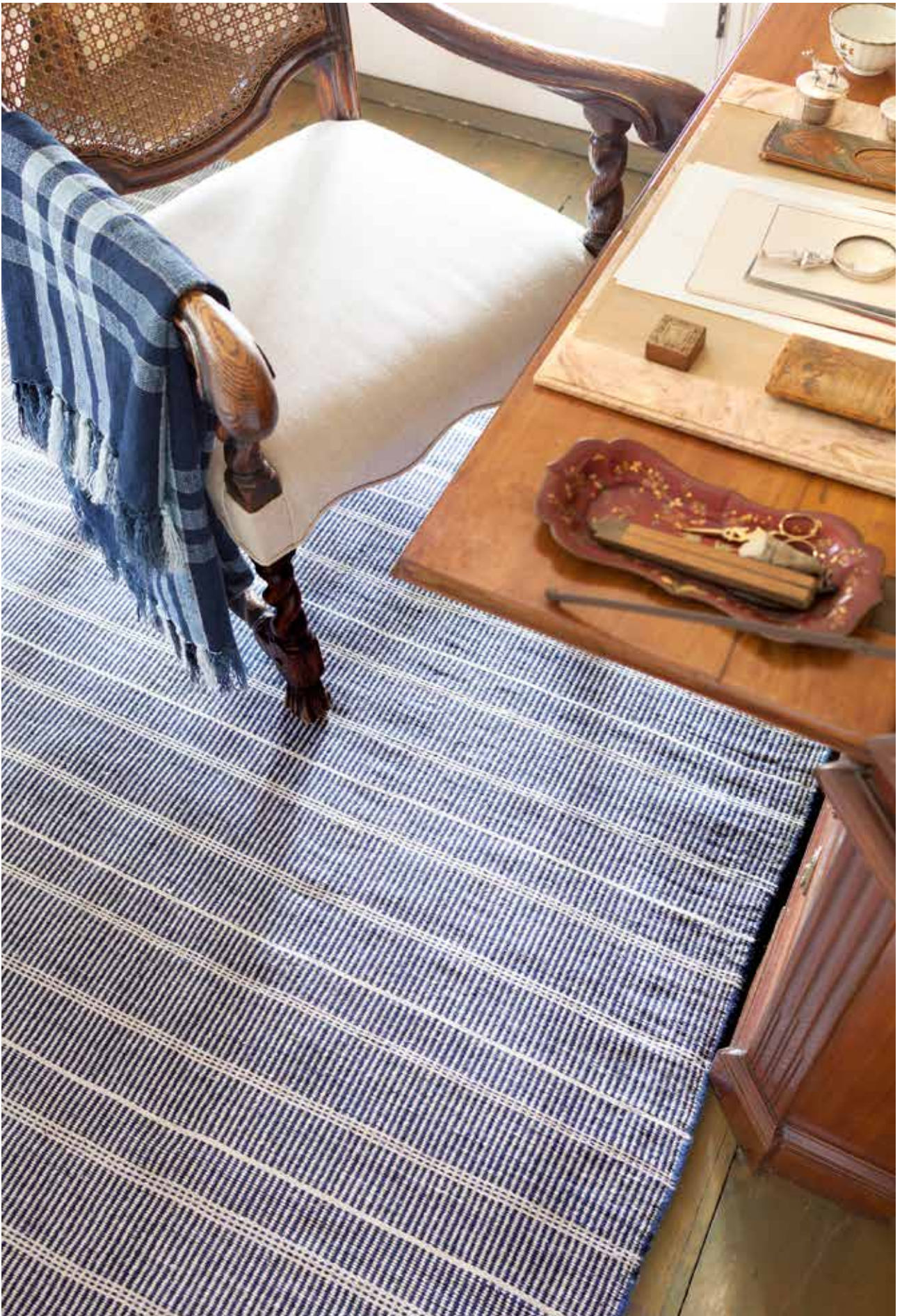
Samson Navy, indoor outdoor PET rug