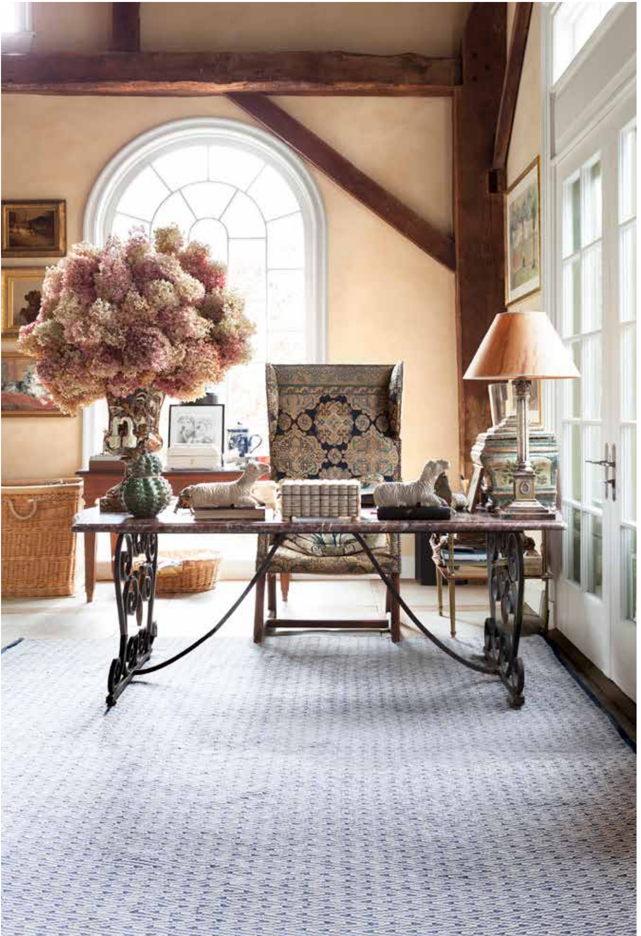
Streeter, indoor outdoor PET rug