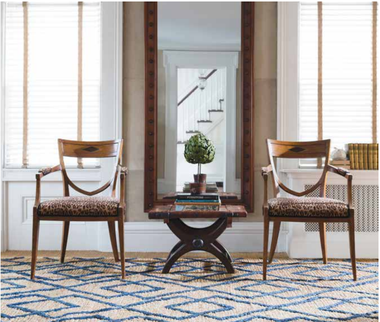
Marco Navy, jute woven rug

A: We are pleased to advise that you can place an order for any product available in the current Dash & Albert product catalogue through any accredited Dash & Albert stockist or interior designers who hold an account with Winton House. Products not stocked in Australia by Winton House are deemed as Special Orders. All Special Orders require a 50% non-refundable deposit be paid prior to order being placed with our US supplier with the balance to be paid prior to shipping to your nominated delivery address.