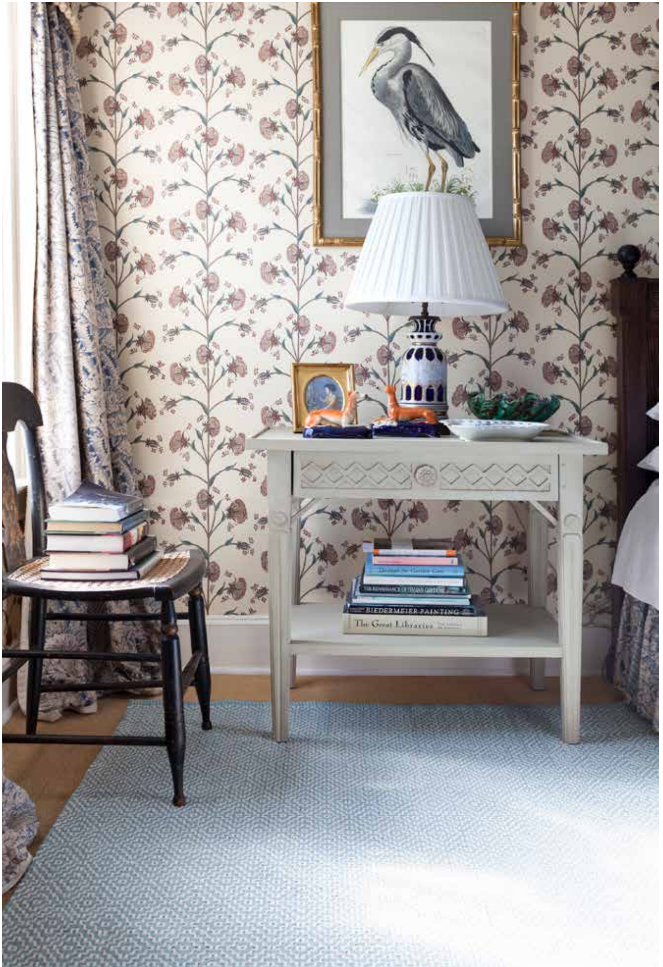
Beatrice Blue, cotton woven rug