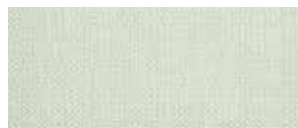
BEATRICE LIGHT GREEN