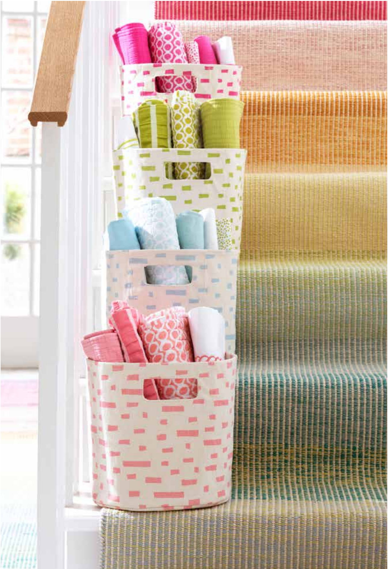
Watercolour, cotton woven rug