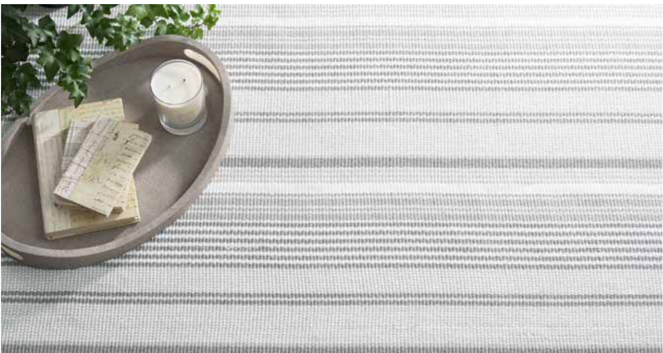
Gradation Ticking, cotton woven rug

A: When storing your rug, do not fold or place the rug in an airtight plastic bag. It is advisable to roll the rug up along its shortest length with the backing facing outwards and then wrap it with a cloth for protection while it is in storage.