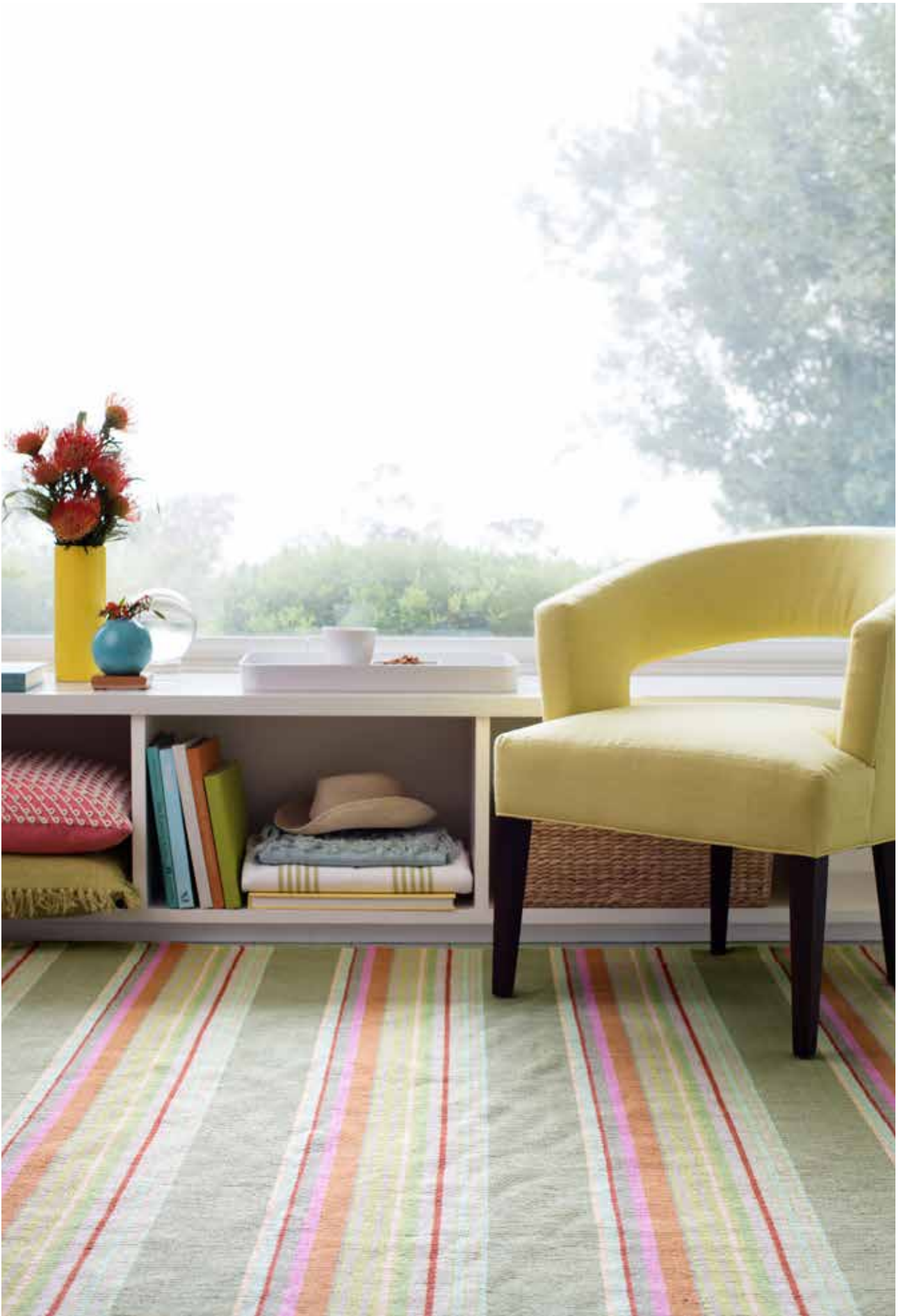
Stone Soup, cotton woven rug