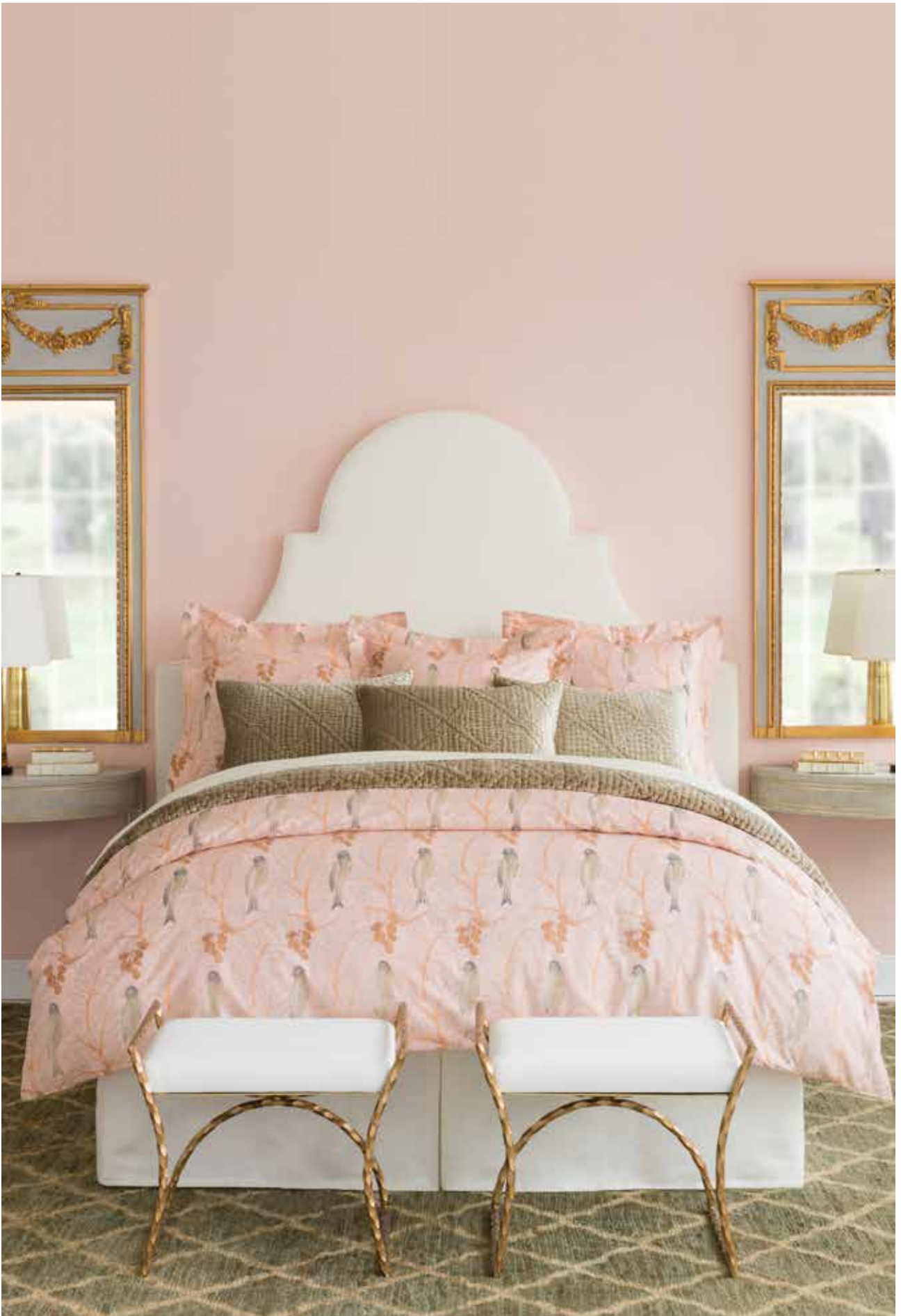
Casablanca, jute handknotted rug