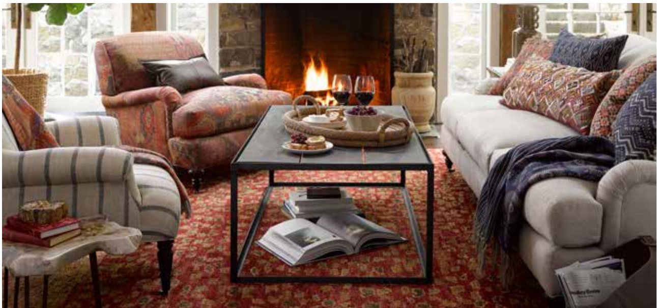
Cinnabar, jute handknotted rug

A: We are pleased to advise that you can place an order for any product available in the current Dash & Albert product catalogue through any accredited Dash & Albert stockist or interior designers who hold an account with Winton House. Products not stocked in Australia by Winton House are deemed as Special Orders. All Special Orders require a 50% non-refundable deposit be paid prior to order being placed with our US supplier with the balance to be paid prior to shipping to your nominated delivery address.