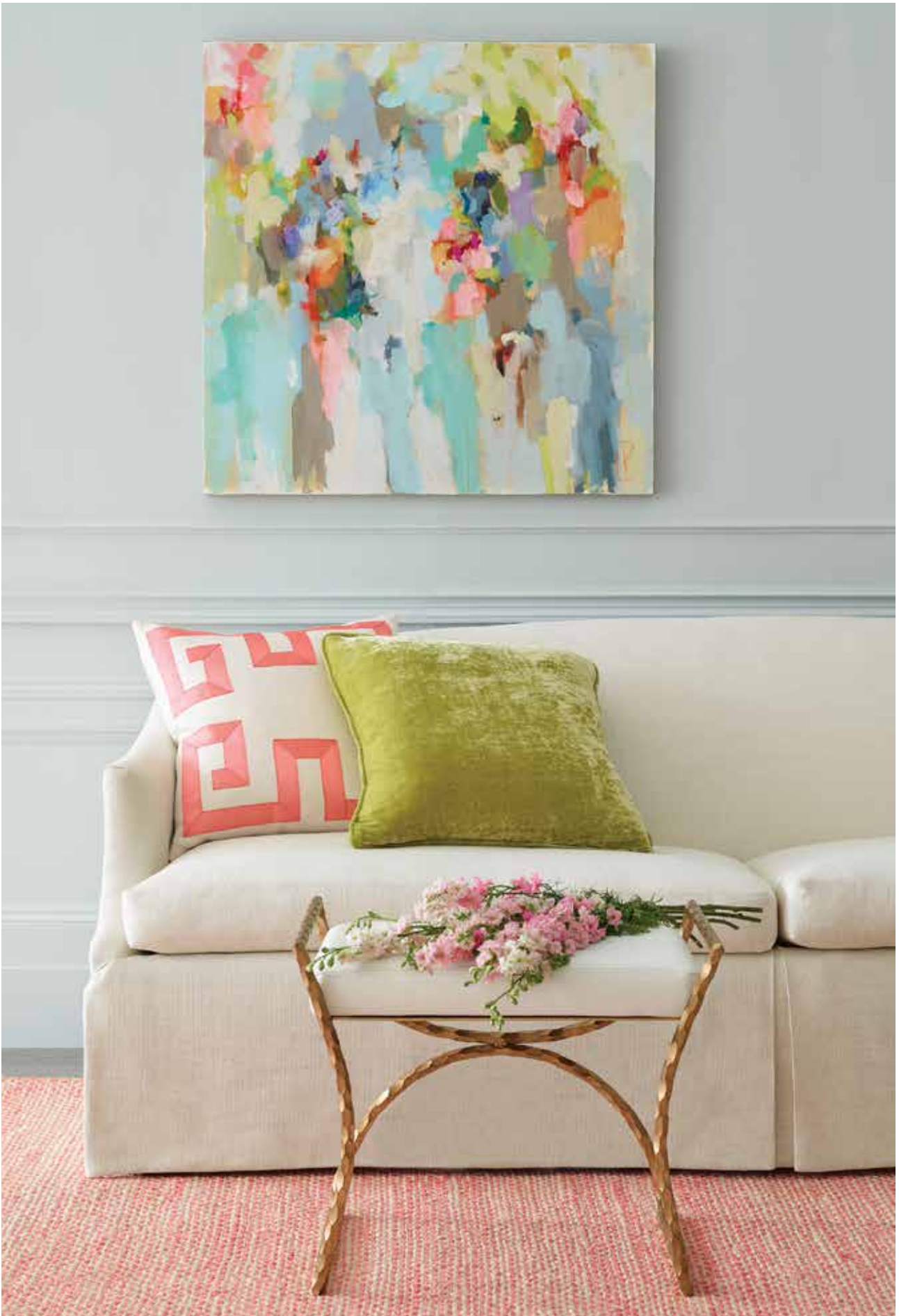
Jacinto Geranium, jute woven rug