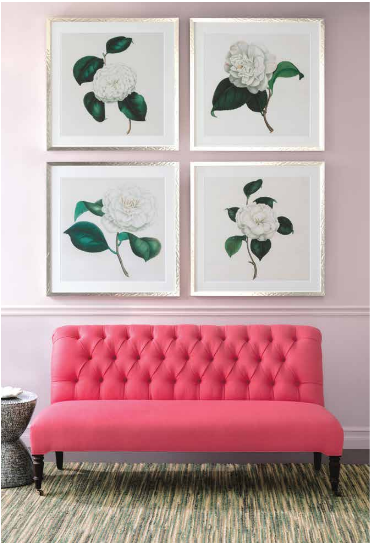
Tenali Emerald, jute woven rug